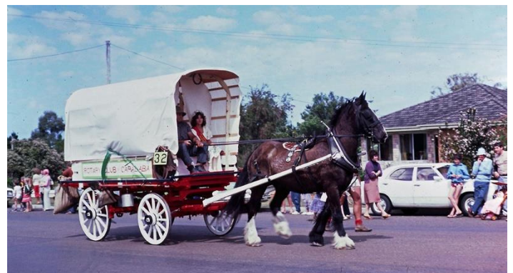
Capalaba Rotary Strawberry Queen Entrant 1981

Meetings followed in swift succession, March 8, March 15, and the rapidly materialising Capalaba Rotary Club finally existed officially in the middle of that month. The Rotary Club of Capalaba was born, at least on paper, April 14, 1979